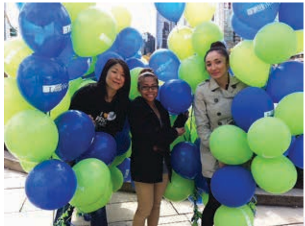
Law Week's 2013 theme, Access to Justice: The Role of Public Opinion. Six locations across BC participated in celebrating the 31st Anniversary of the Charter of Rights.

The ninth annual Law Week "Catch Me If You Can" Fun Run was held in Creekside Park. Proceeds from the run supported Access Pro Bono.