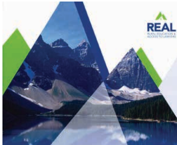
Marketing Materials: A 10 page brochure was produced that captured testimonials of REAL student experiences. In addition, there were two guide-books produced - one for lawyers and one for students.

2013 marked the fifth year for the Rural Education and Access to Lawyers (REAL) initiative as the CBABC partnered with the Law Society of British Columbia to support both law firms and law students throughout the province. Promotion within BC resulted in 15 student placements this past summer. Aimed at addressing the current and projected shortage of lawyers practicing in small communities and rural areas of BC, REAL continues to attract year-round attention nationally from media, law schools, students and firms alike. Alternative funding streams are being explored to ensure that the Rural Education and Access to Lawyers initiative continues for years to come, with a renewed focus on targeting those communities in BC with the highest need for legal support. Numerous presentations and reports were generated this past year resulting in successful bids for funding the program into 2014 as both the Law Society of BC and the Law Foundation of BC have teamed with CBABC for another year.