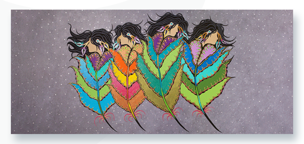
Artwork by Tracey Metallic

The Agenda for Justice Platform Update included restorative justice, Indigenous courts, and expansion of legal aid services for the benefit of Indigenous people.